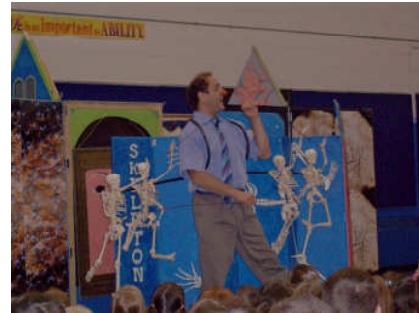
Marvelous Marvin dances with the skeletons.

We have completed all of the mandated emergency drills including evacuation and lock down procedures. Our students did a wonderful job cooperating and following instructions. I feel confident that all students and staff will be able to carry out the necessary procedures should an unexpected need arise. October promises to be another busy month. I hope to see many of you at the PTA Pumpkin Carving Night scheduled for Friday evening on October 24 th . Don't forget to wear your costume! Ms. Mowry